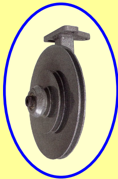
SR-2 Speed Reducer/Controller